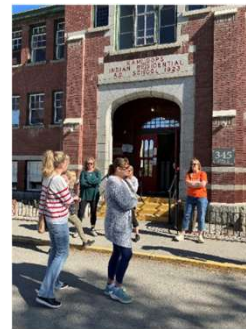
Hillcrest @ Kamloops Residential School