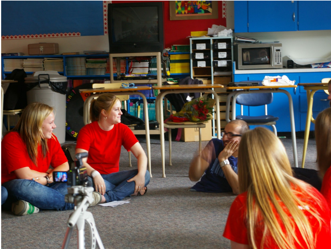
District Student Leadership Me to We Committee