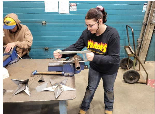
cutting pipe for her build